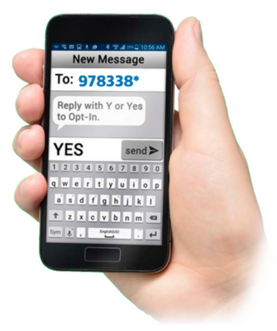
*if your number is Canada-based.

You can also opt out of these messages at any time by simply replying to one of our messages with " Stop ".